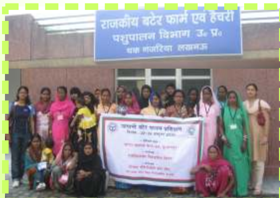
Trainees visiting Chak ganjaria farm hatching