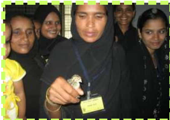
Trainee holding day old chick