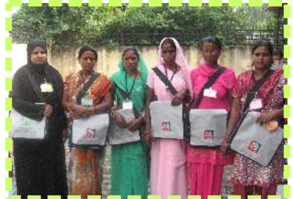
Trainees at Chak Ganjaria Farm with Training Kit