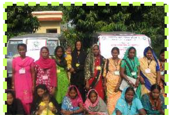
Trainees at their leisure time at Chak Ganjaria Farm Lucknow