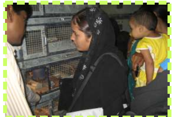
Trainees viewing the cages of quail at Chak Ganjaria Farm, Lucknow