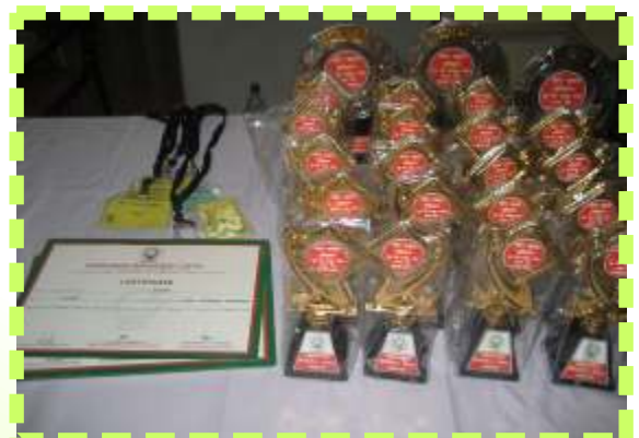
Certificates and Momentos distributed during closing session to the trainees