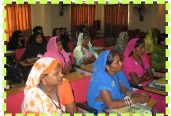
Trainees in the class room